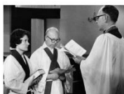
50th Anniversary of Women's Ordination as Pastors in the Lutheran Church November 22, 2020

From SundaysandSeasons.com. Copyright © 2020 Augsburg Fortress. All rights reserved. Reprinted under OneLicense.net # A-722139. Used by permission of Augsburg Fortress.